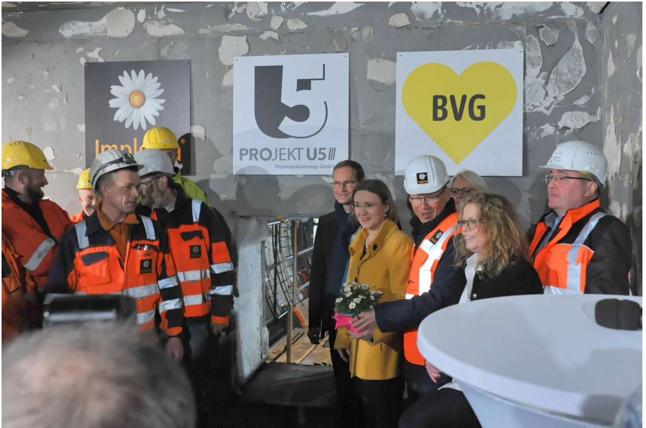
Breakthrough! Implenia closes the gap between the U55 and the existing U5 line in Berlin.