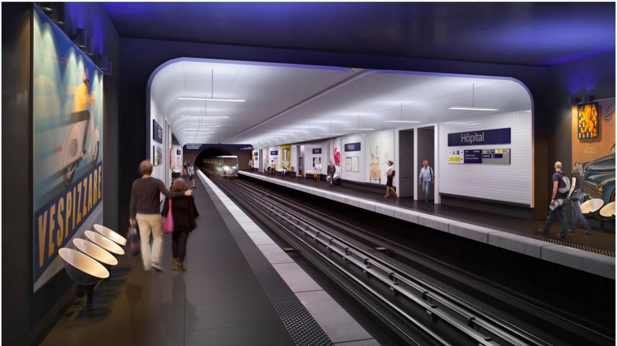
By winning the contract to extend Métro line 11 in Paris, Implenla is helping to improve links between the Île-de-France region and the French capital by 2030. Artist’s impression shows the future Station Hôpital.