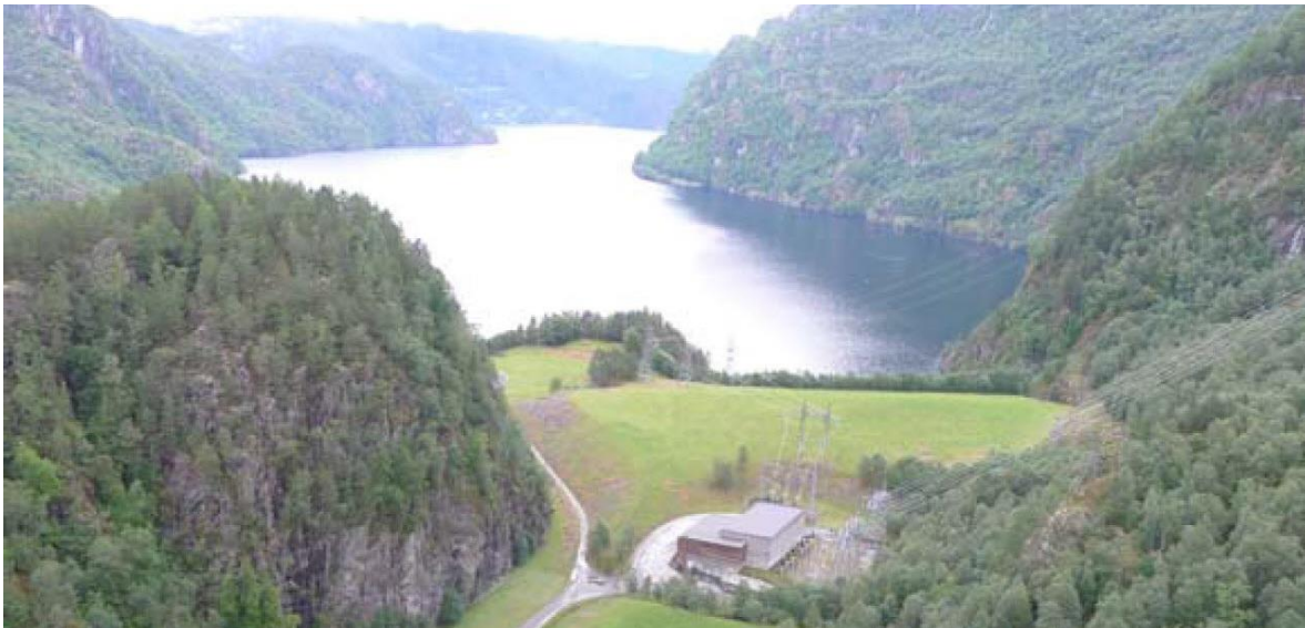
In Kviteseid, Norway, Implenia is carrying out tunnel and civil engineering work on the new subsea interconnector between the UK and Norway.

Dietlikon, 29 June 2015 – The world's longest subsea electricity interconnector, the NSN Link between the UK and Norway, will be completed by 2021. The 720 km-long subsea cable will run between Blyth in England and Kviteseid in Norway. It will link the two countries' electricity markets and will have a capacity of 1,400 megawatts – equivalent to the power needed to light 750,000 homes. The project will allow the UK to increase its share of renewable energy and balance out the fluctuations of its own wind power production. Norway will benefit from reasonable power when there is a surplus in the UK and increased security of power supply in cold and dry periods. In this context, the Norwegian network operator Statnett commissioned Implenia to carry out infrastructure works at Kviteseid. The contract, worth around CHF 23 million (nearly NOK 200 million) includes various complex civil engineering and tunnelling jobs that will allow Implenia to utilise its proven capabilities in infrastructure construction. These will include excavation, blasting and tunnelling (2.4 kilometres), slotted hole drilling, construction of tracks, ditches and converter stations, as well as water, fire, drainage and sewerage systems. Work is scheduled to start in August 2015 and this part of the total project work should be completed by summer 2017.