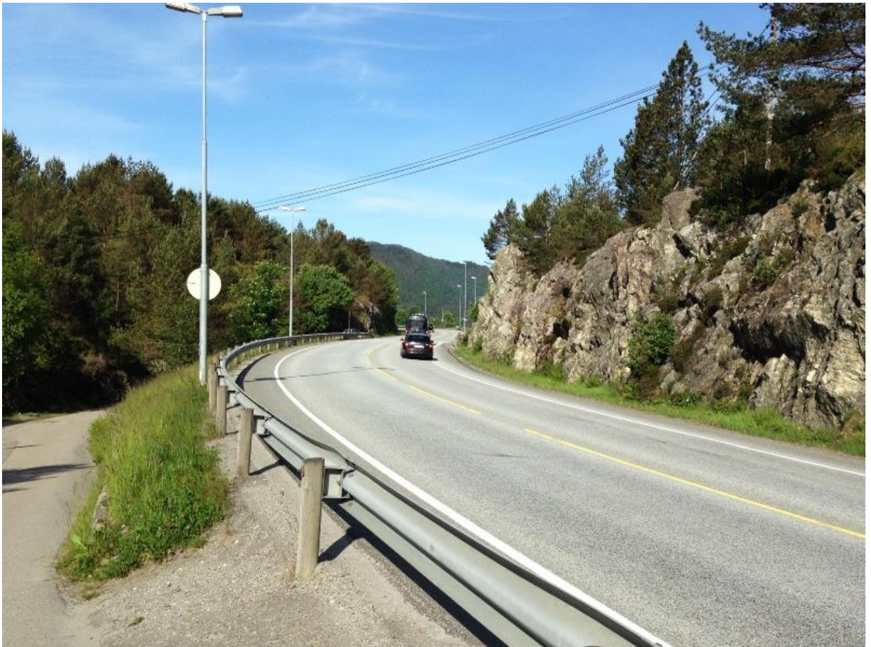
The E39 on the Norwegian island of Flatøy: site of Implenia's new construction project.