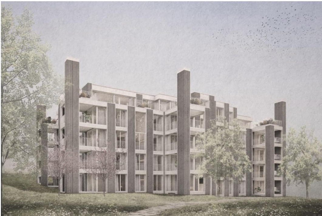
The new Katzenbach residential development of 30 apartments in Zurich-Seebach.