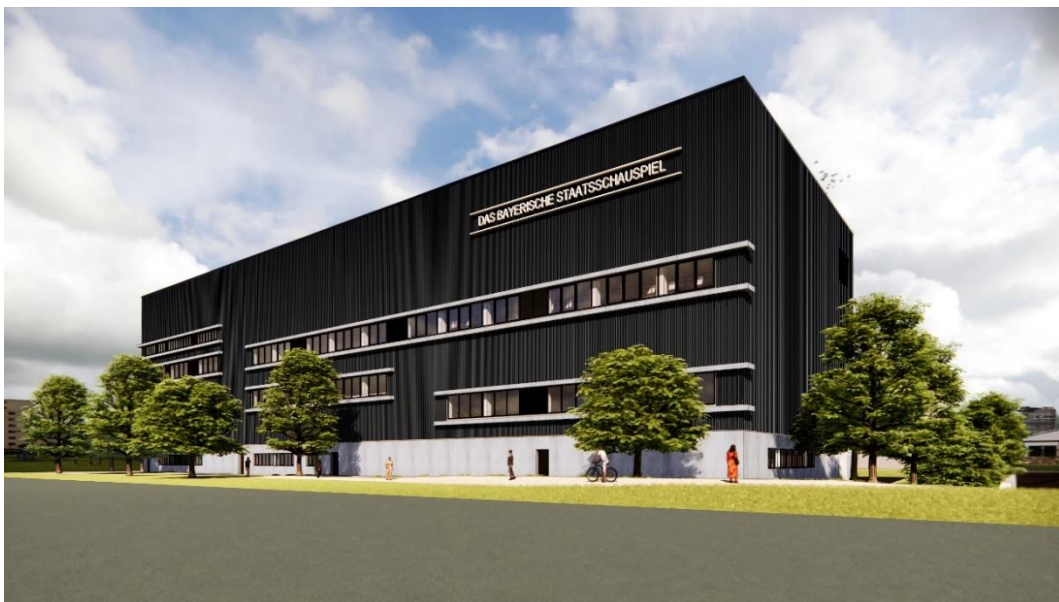
A demanding and complex new build for the Bavarian State Theatre in Munich: new rehearsal and workshop centre in the east of Munich (image: © Dömges Architekten AG, Regensburg).

Through these two contracts, Implenia is continuing to lend its extensive expertise to the sustainable renewal of Switzerland's real estate portfolio. The two contracts are worth over CHF 30 million in total.