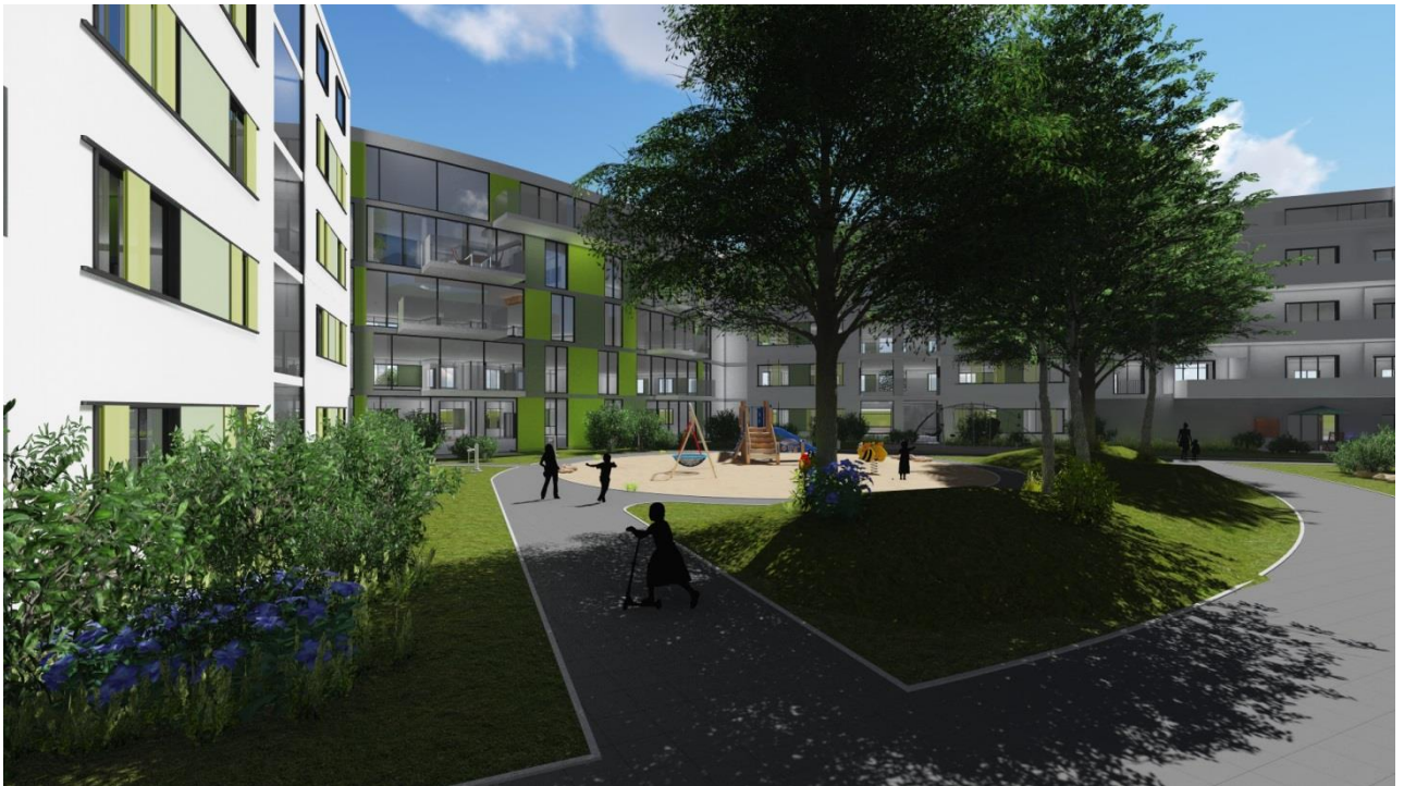
Implenia VR's virtual image of the inner courtyard of the Christian-Weiß residential development in Karlsruhe. (Image: Implenia)